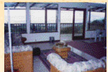
San Antonio de Escazú, incomparable views. $160,000 (H-767-SJ)