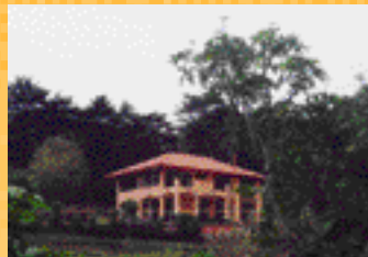
New, beautiful, lots of light $425,000 (H-793-SJ)