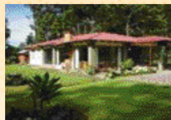
Luxury home in El Tirol, Heredia $215,000 (H-782-H)