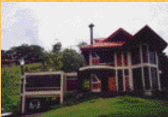
Fantastic Escazú view home $800,000 (H-788-SJ)