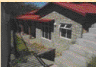
Cariari Golf course home $295,000 (H-763-H)