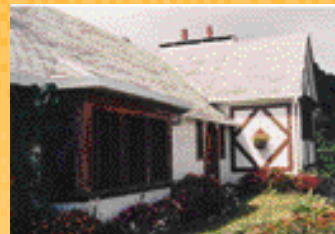
Heredia Hills, breathtaking views $299,000 (H-255-H)