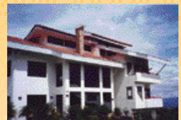
Gorgeous views, landscaped gardens, tennis court $350,000 (H-611-H)