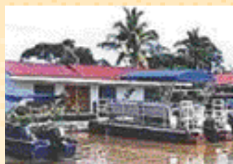
Sport Fishing Lodge, Parismina $330,000 (HT-574-L)