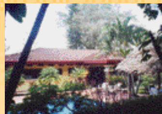
Country Club Living $395,000 furnished (H-787-A)