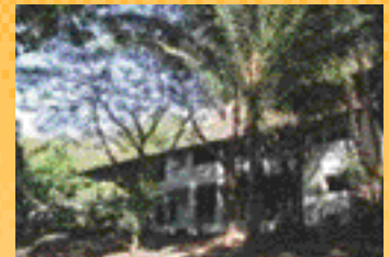
Beautiful 16 room Beach Hotel, Montezuma $550,000 (HT-575-P)