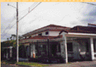
Escazú, large home, gated community $225,000 (H-698-SJ)