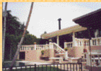
Luxury Mansion $900,000 will rent (H-794-SJ)