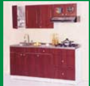
Hood & faucet not included

Comercializadora Internacional: Exclusive Distributor Maderinco, Socoda, Ceramica Andina