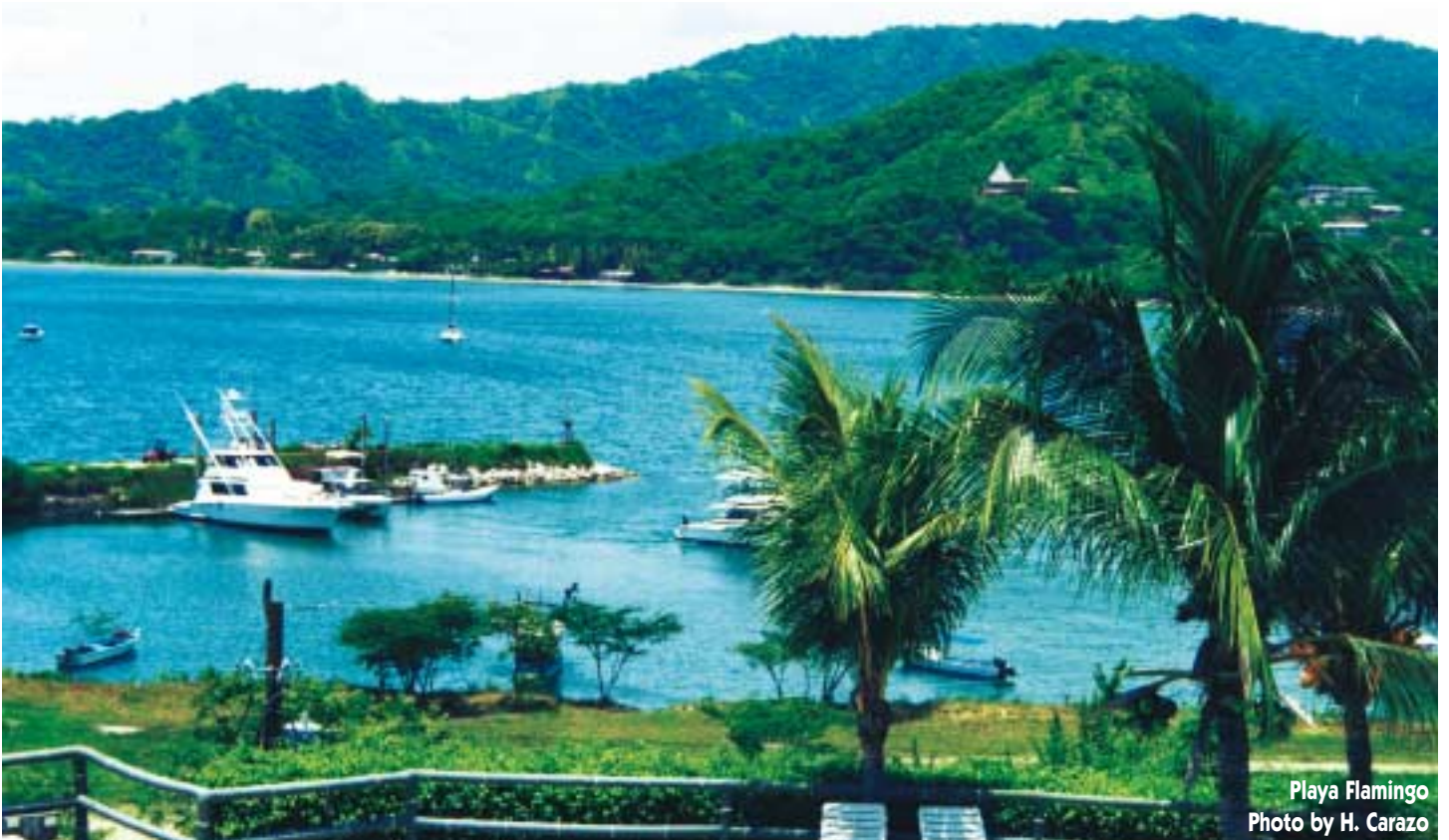
Playa Flamingo

This area of Costa Rica located on the West Coast of the Nicoya Peninsula, extends from Playa Carrillo in the south all the way up to Puerto Soley in the north near the border with Nicaragua. In this area of Costa Rica, known as the “Gold Coast” one can find many bays and coves and endless beaches that will take your breath away. Watching a sunset full of indescribable colors while floating in the calm waters of Playa Real (home of the Bahia de Los Piratas hotel) or while wading in a private pool high on a hill overlooking the Gulf of Papagayo (at the Giardini di Papagayo All inclusive Resort) one is transported to a world without cares where your